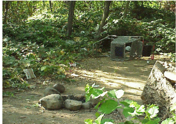
River Property Illegal Campsite

Description: The proposed project site is located in the northeast portion of the Parkview Neighborhood on 12.5 acres of land currently owned by the City of Redding shown on Exhibit B. The project could be expanded to include an adjacent 1.14 acre privately-owned parcel, if financially feasible. The City's property consists of approximately 3 acres of land on an upper terrace area, with the balance adjacent to the river. The upper portion is currently under lease to the People of Progress and is utilized as a community garden. The lease expires in October 2000. Also on the upper portion is an old stone structure and plaque commemorating it as a historical structure (see front cover). A seasonal drainage channel bisects the property in an east-west direction. The property is currently overgrown with vegetation which is an attraction to transient campers, as evidenced in the above right-hand photo.