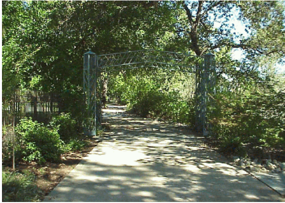
Sacramento River Trail

The estimated cost of the project is $660,000, not including the cost of additional property acquisition. The activities would include: